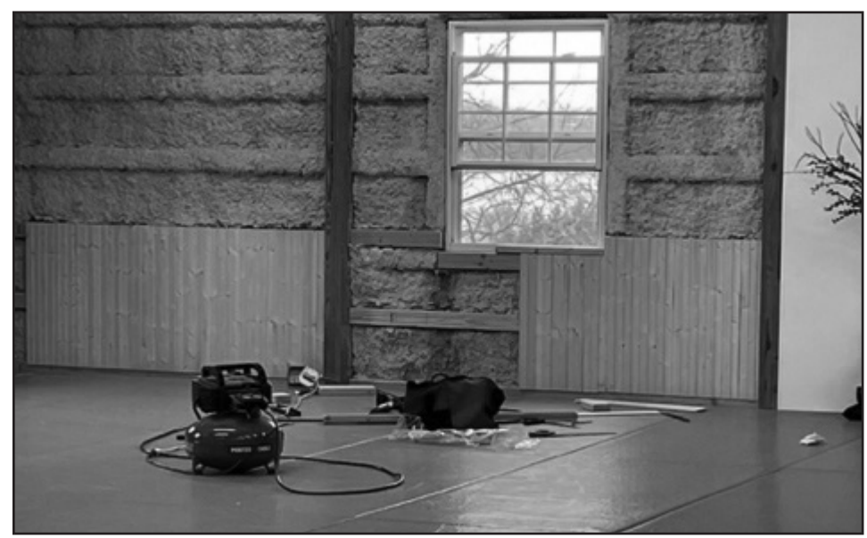
Wainscotting project, always improving.

we slow down and deliberately focus on every step of a task. This is called a Closed Loop thought process (or what we call "beginner's mind"). When a skill or task has been learned, our brain puts it into an Open Loop process or autopilot, which requires significantly less cognitive attention. Once something has been committed to Open Loop it can be very hard to make changes or updates to the process.