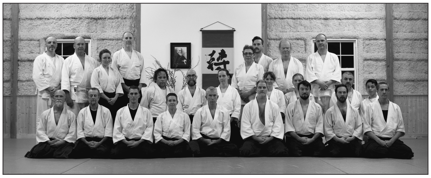
BCA Holiday Picture 2022

"I was returning from high school one day and a runaway horse with a bridle on sped past a group of us into a farmer's yard looking for a drink of water. The horse was perspiring heavily. And the farmer didn't recognize it so we cornered it. I hopped on the horse's back. Since it had a bridle on, I took hold of the tick rein and said, "Giddy-up." Headed for the highway, I knew the horse would turn in the right direction. I didn't know what the right direction was. And the horse trotted and galloped along. Now and then he would forget he was on the highway and start into a field. So, I would pull on him a bit and call his attention to the fact the highway was where he was supposed to be. And finally, about four miles from where I had boarded him, he turned into a farmyard and the farmer said, "So that's how that critter came back. Where did you find him?" I said, "About four miles from here." "How did you know you should come here?" I said, "I didn't know. The horse knew. All I did was keep his attention on the road."