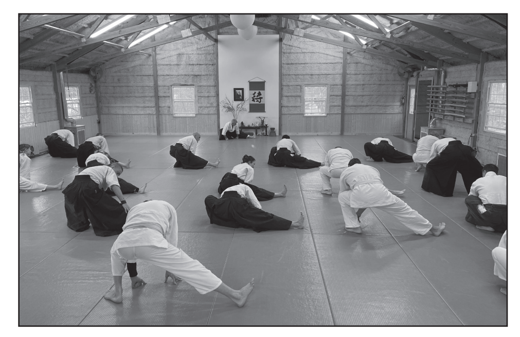
Post pandemic class size rebounding

Maybe you too can recognize some of these patterns. Thankfully, after all this introspection, there is an antidote that is built directly into this transformative practice of Aikido. Simply come back to train with openness again and again. One does not need to be preoccupied or even to safeguard against the above patterns though it may be helpful at times to identify them when they arise. Like losing count during a sit, just return to the practice. Like all things complicated, the answer is simple. When receiving ukemi, be light, connected, and dynamic. Attack honestly. Respond to what is actually happening. And always keep looking. The fear of falling can become the falling of fear. \(\mathbb{O}\)